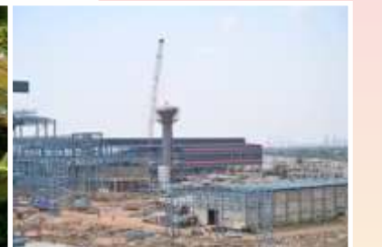
JAIRAJ STEEL PLANT